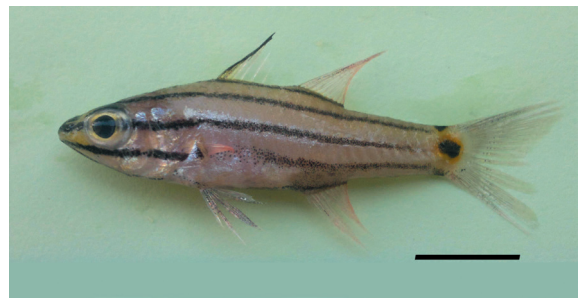
Fig. 2. Cheilodipterus novemstriatus captured off the Syrian coast: (2279 MSL), scale bar = 10 mm

On 02 October 2016, one specimen of Cheilodipterus novemstriatus (RÜPPELL, 1838), was captured from 25m off Lattakia Beach, located on the Syrian coast, by 35° 46' E and 35° 29' N (Fig. 1), using trammel net, on sandy bottom, at 6m depth., and described in the present paper, following BELLO et al. (2014). The specimen was